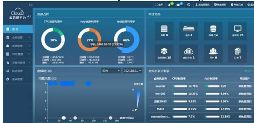
Figure 2 Computer teaching management system

Java platform can be used in the design of the system, and it is easy to build a SOA system with educational administration function. After analyzing, J2EE can basically meet the requirement of this hypothesis, and the concrete construction system is shown in figure 2.